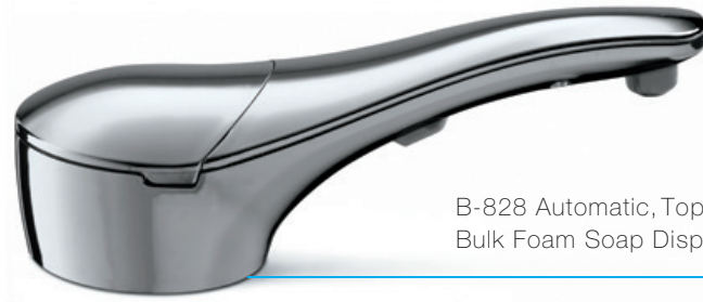
B-828 Automatic, Top-Fill Bulk Foam Soap Dispenser